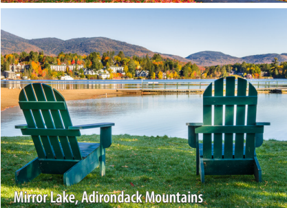
Mirror Lake, Adirondack Mountains