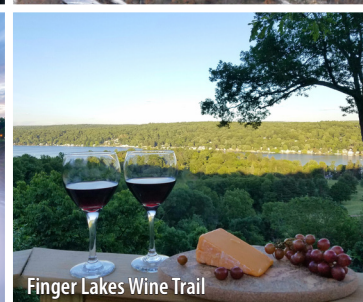
Finger Lakes Wine Trail