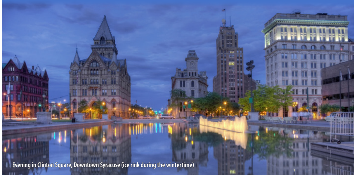
Evening in Clinton Square, Downtown Syracuse (ice rink during the wintertime)

From tech, the arts, cultural events, and beautiful natural surroundings to sports and seasonal outdoor activities, Onondaga County is a great place to live, work, play, and raise a family.