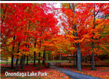
Onondaga Lake Park