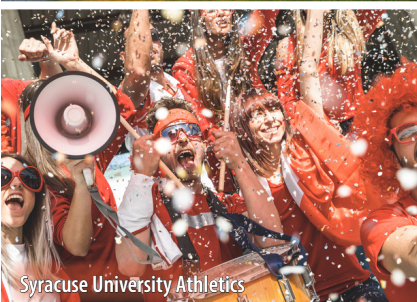
Syracuse University Athletics