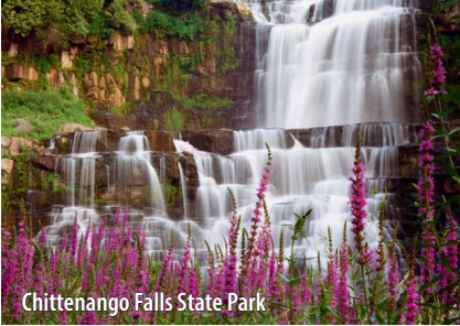
Chittenango Falls State Park