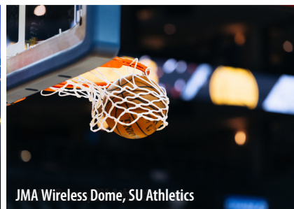
JMA Wireless Dome, SU Athletics