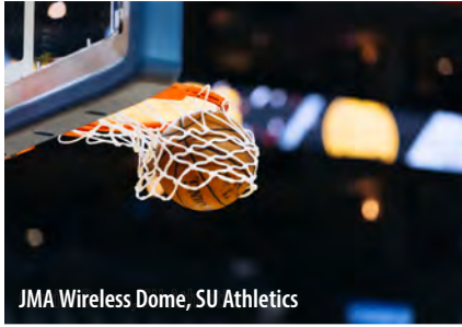
JMA Wireless Dome, SU Athletics