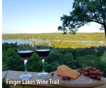
Finger Lakes Wine Trail