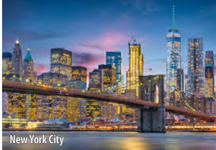
New York City