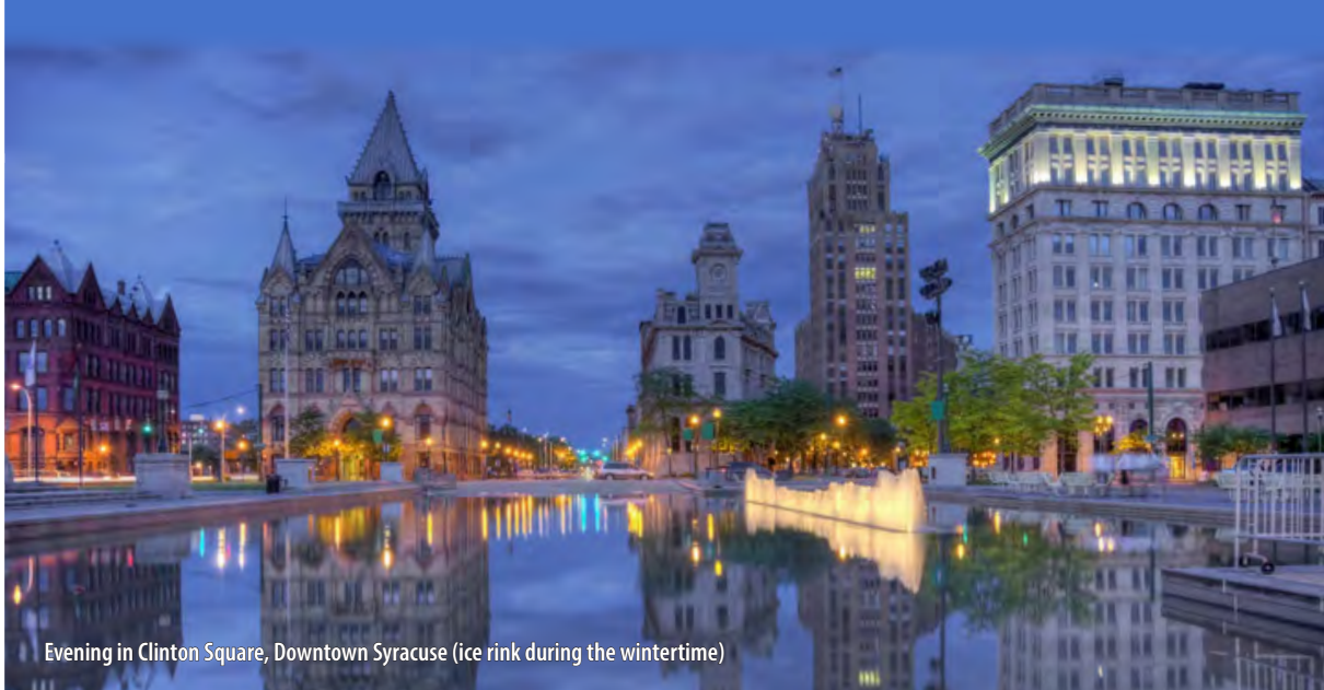
Evening in Clinton Square, Downtown Syracuse (ice rink during the wintertime)