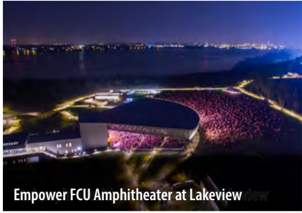
Empower FCU Amphitheater at Lakeview