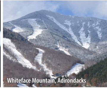
Whiteface Mountain, Adirondacks