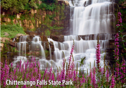
Chittenango Falls State Park

From tech, the arts, cultural events, and beautiful natural surroundings to sports and seasonal outdoor activities, Onondaga County is a great place to live, work, play, and raise a family.