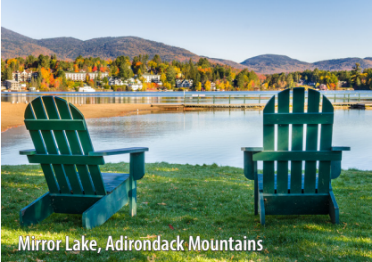
Mirror Lake, Adirondack Mountains