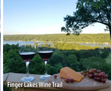
Finger Lakes Wine Trail