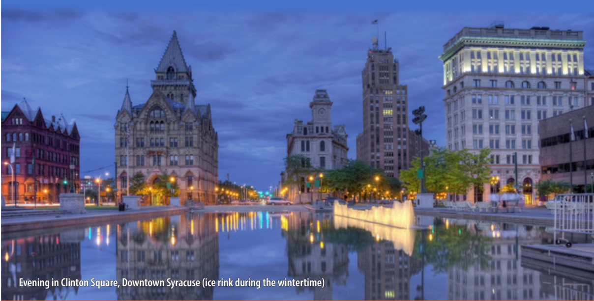
Evening in Clinton Square, Downtown Syracuse (ice rink during the wintertime)