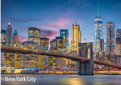
New York City