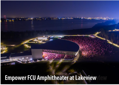
Empower FCU Amphitheater at Lakeview