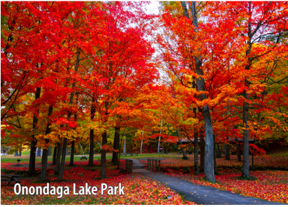
Onondaga Lake Park