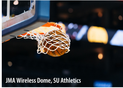
JMA Wireless Dome, SU Athletics