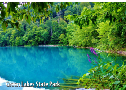
Green Lakes State Park