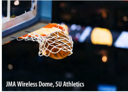
JMA Wireless Dome, SU Athletics