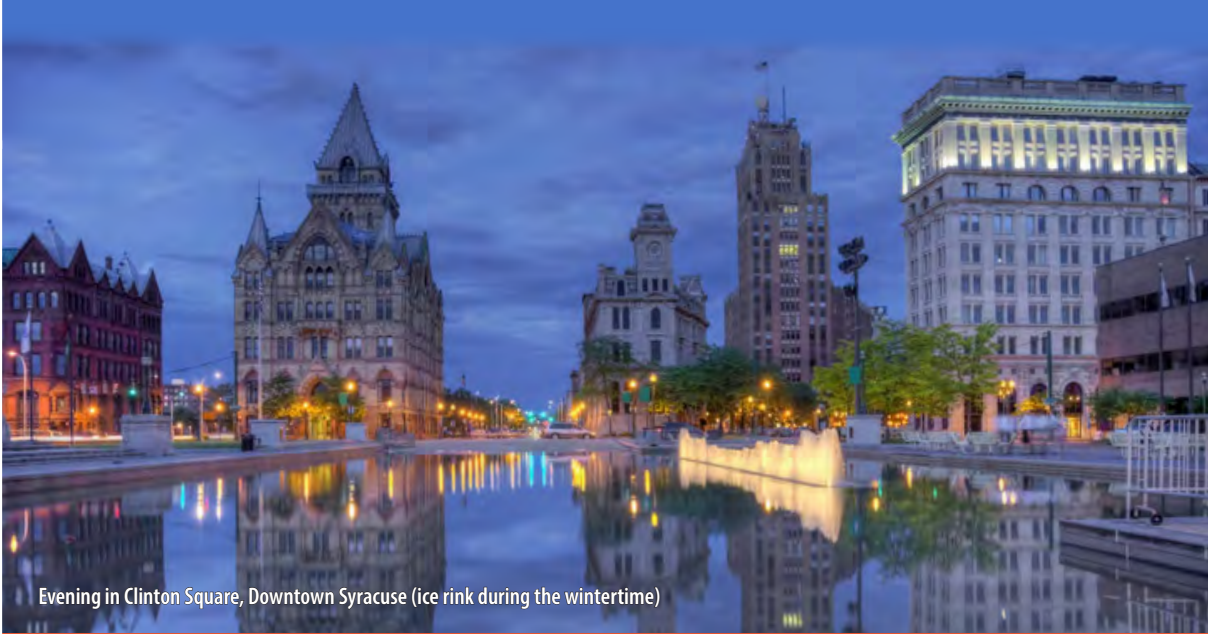
Evening in Clinton Square, Downtown Syracuse (ice rink during the wintertime)