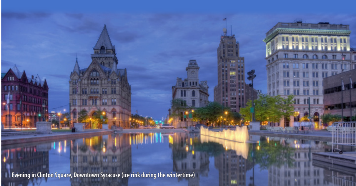
Evening in Clinton Square, Downtown Syracuse (ice rink during the wintertime)