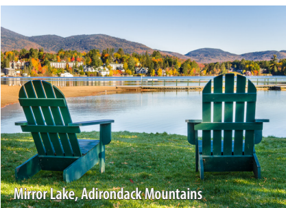
Mirror Lake, Adirondack Mountains