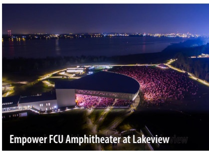
Empower FCU Amphitheater at Lakeview