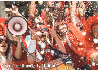
Syracuse University Athletics