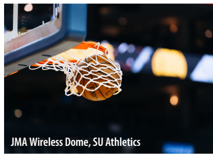
JMA Wireless Dome, SU Athletics