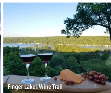
Finger Lakes Wine Trail