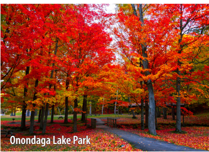
Onondaga Lake Park