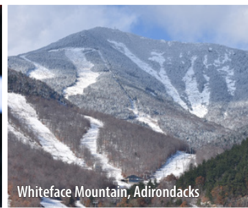
Whiteface Mountain, Adirondacks