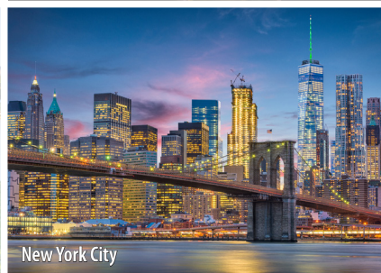
New York City