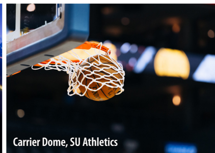
Carrier Dome, SU Athletics