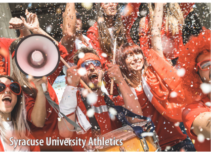
Syracuse University Athletics