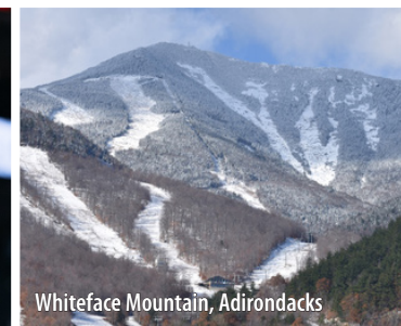
Whiteface Mountain, Adirondacks