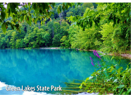
Green Lakes State Park