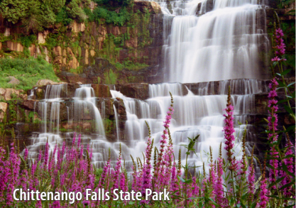
Chittenango Falls State Park