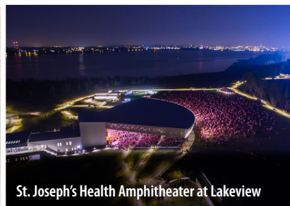
St. Joseph's Health Amphitheater at Lakeview