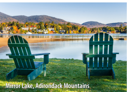
Mirror Lake, Adirondack Mountains