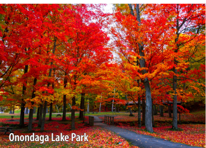
Onondaga Lake Park