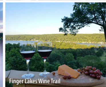
Finger Lakes Wine Trail